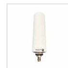
External fixed-mount antenna kit